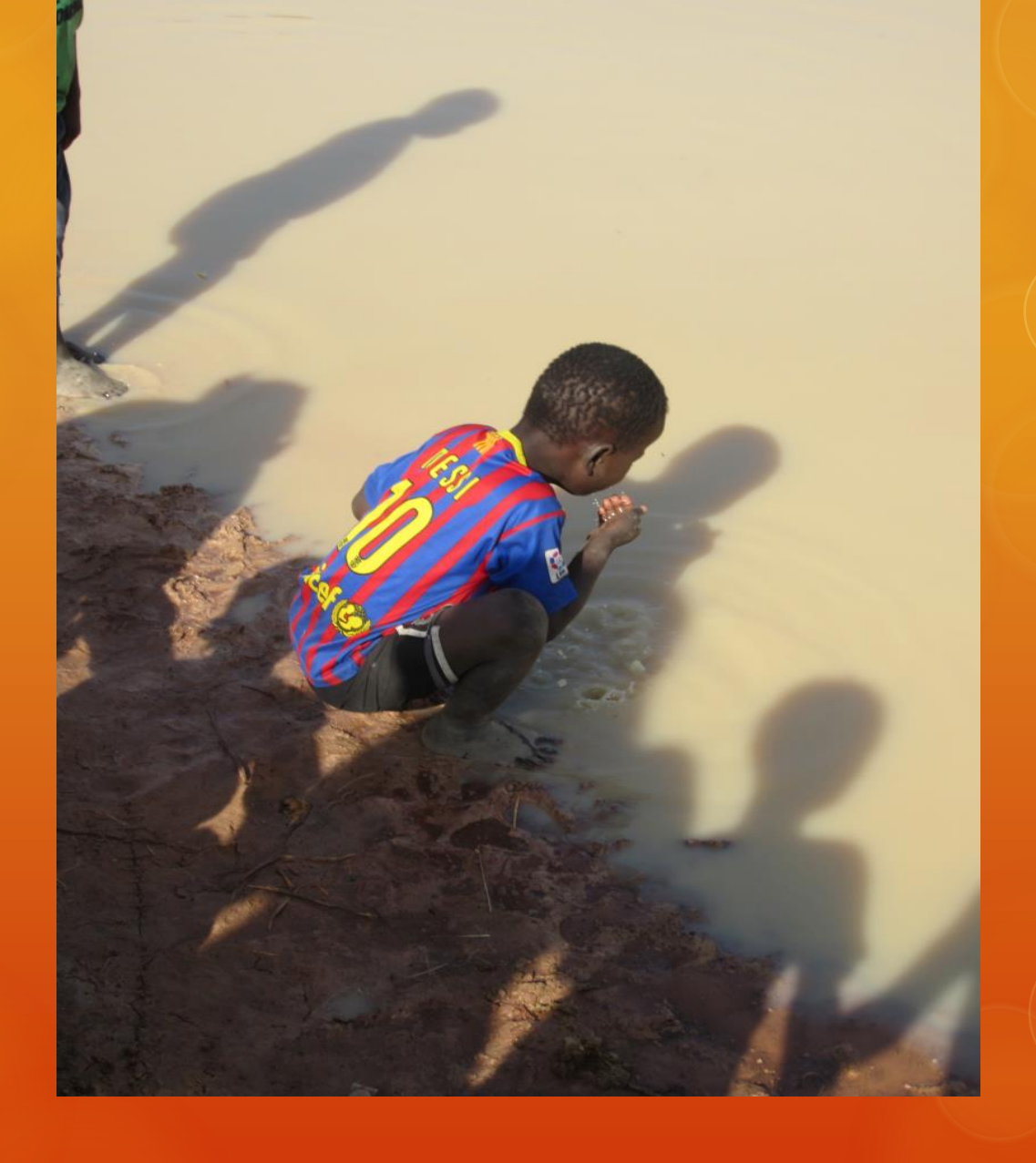
Critically Question the Inequities